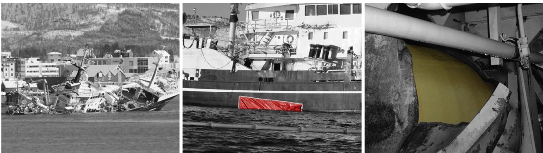
Salvage operation of MS Hundvåkøy using the FlexiShape Miko Plaster®